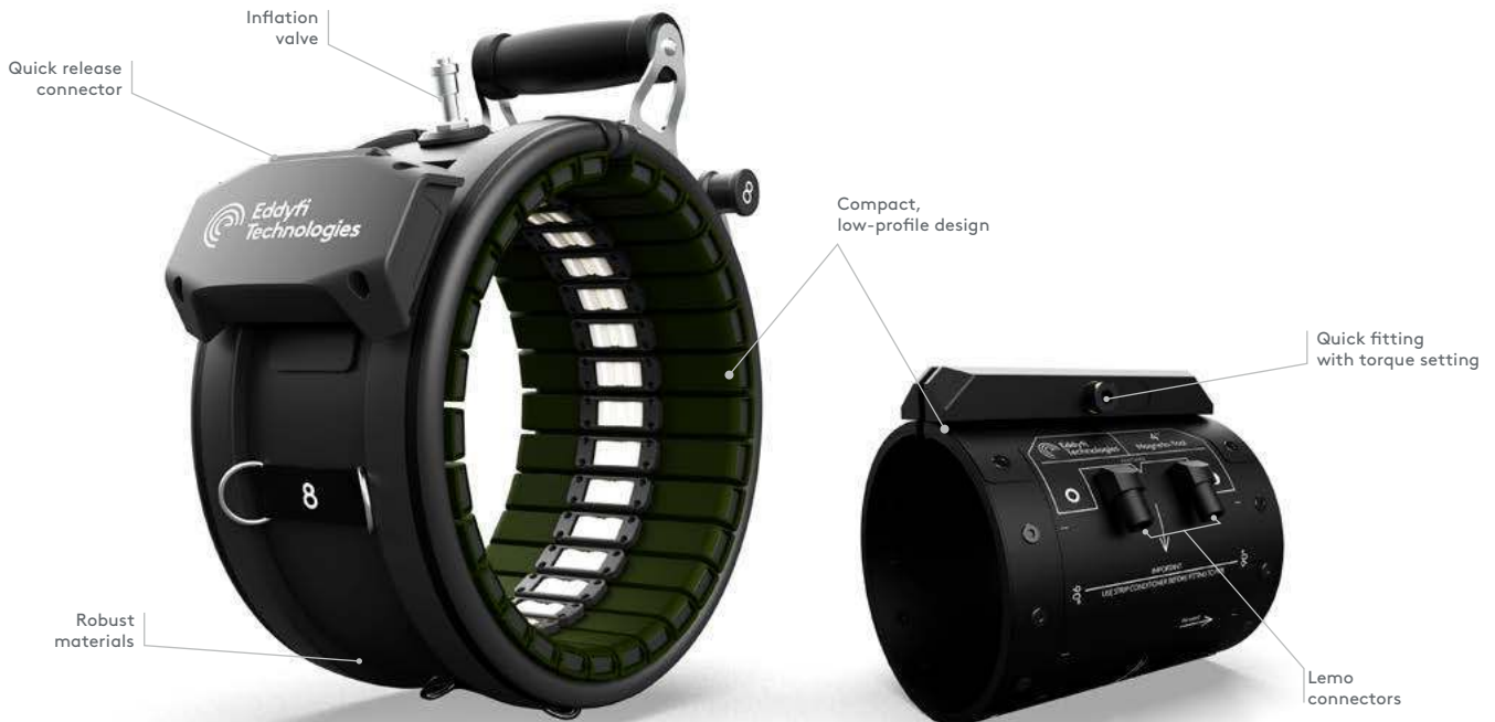
PIEZO TOOLING 6 - 72 inch

Sonyks is an incredibly versatile system that allows operators to address more applications thanks to short-range and medium-range capabilities in addition to long-range ultrasonic testing. For example, use the new 128 kHz magnetostrictive collar to inspect flanged pipes efficiently.